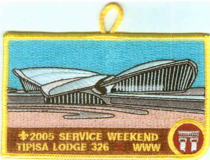
326 Service Weekend 2005. Depiction of the TWA Terminal at John F. Kennedy Airport, New York City. Fifth in the 2004-2005 series, "Famous Architecture".