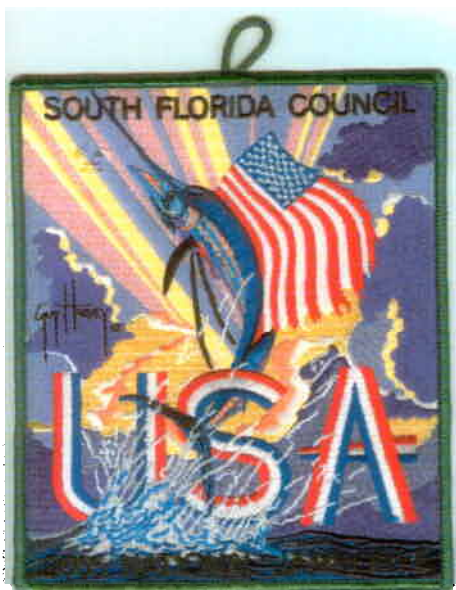
South Florida Council 2005 Jamboree patch; worn as a dangle; five different border colors, to match the JSP border.