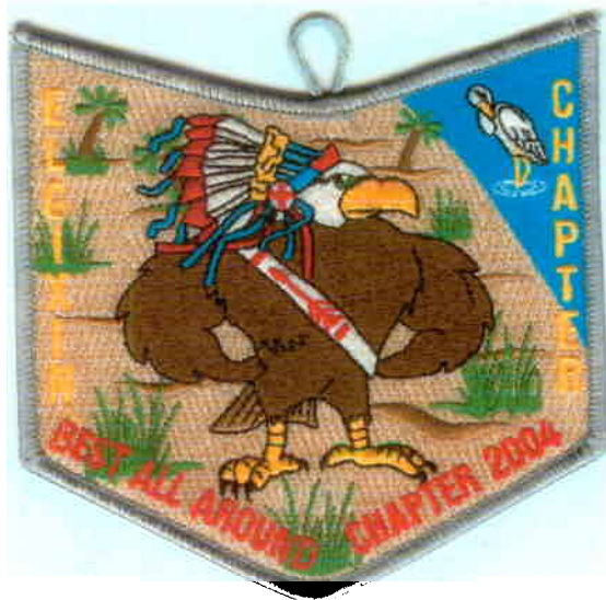
265 Exgixin Chapter X-2 2004; Best All-Around Chapter