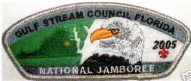
Gulf Stream Council JSP 2005-C eagle; theme depicting Florida wildlife.