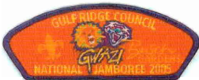
Gulf Ridge Council JSP 2005-A "Gwazi"; theme of "Busch Gardens Rollercoasters".