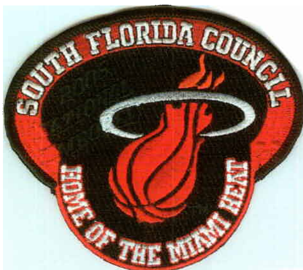
South Florida Council JSP 2005-G Miami Heat design; 111 x 97 mm; JAMBOREE; corrected spelling.