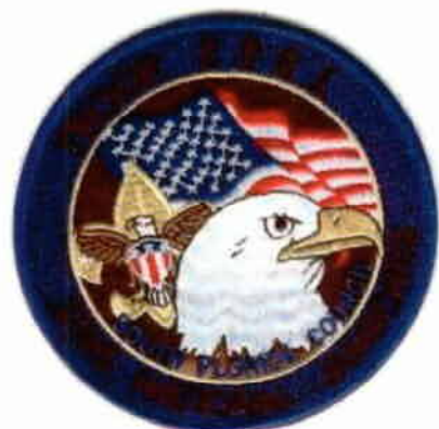
South Florida Council Jamboree 2005; jacket patch (different colors for each troop)