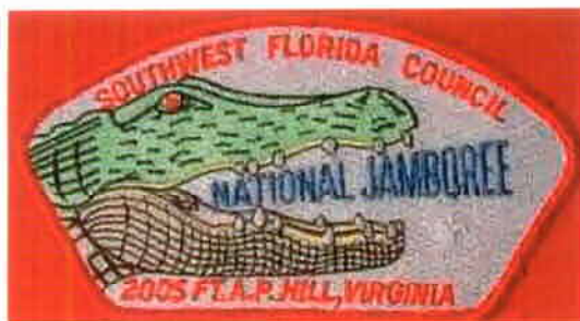
Southwest Florida 2005 Jamboree; RED bdr. Also made: WHT bdr, BLU bdr, GRN bdr.

(right) South Florida Council—Camp Sawyer 2005 (being run by the council as a small summer camp program)