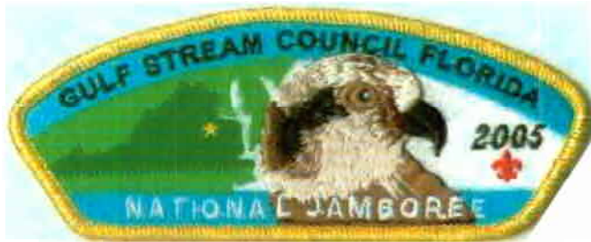
Gulf Stream Council JSP 2005-E hawk; theme depicting Florida wildlife.