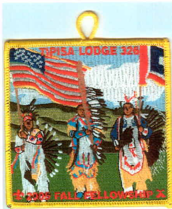
326 Fall Fellowship 2005. First of 2005-06 series.