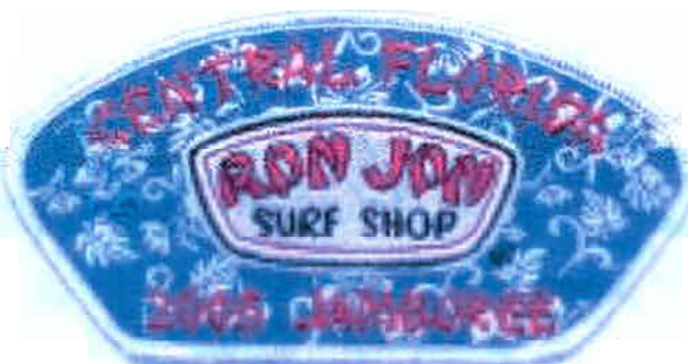
Central Florida Council Jamboree 2005; JSPs with matching troop numbers