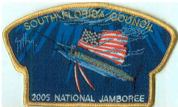
South Florida Council JSP 2005-E Jamboree Staff South Florida Council JSP 2005-E Jamboree Staff; GMY border.