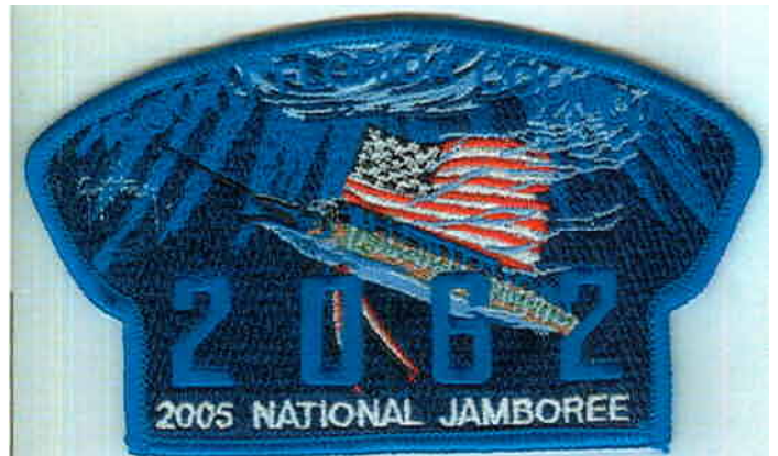
South Florida Council JSP 2005-B Troop 2062; LBL border.