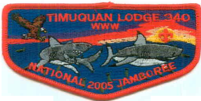
340-S-49 2005 National Jamboree