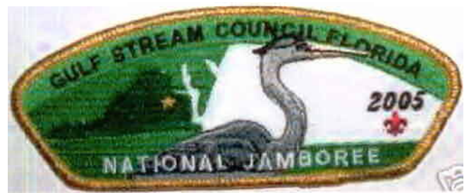
Gulf Stream Council JSP 2005-D heron; theme depicting Florida wildlife.