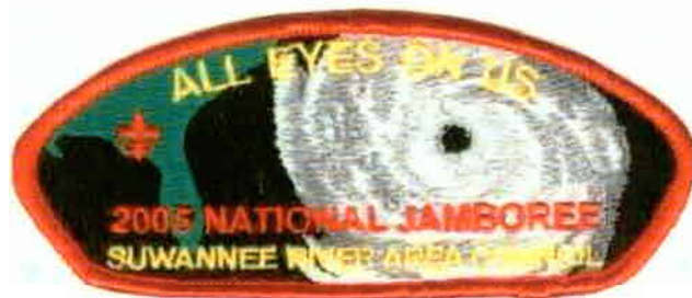
Suwannee River Area Jamboree 2005-B BLK background; "night" JSP