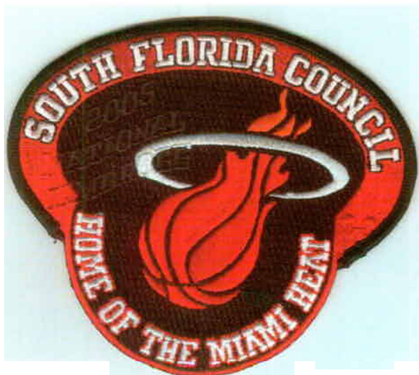
South Florida Council JSP 2005-F Miami Heat design; 130 x 115 mm; JAMBROEE; error.