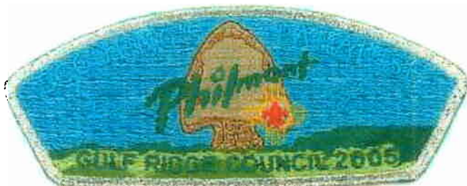
Gulf Ridge Council S-? 2005; Philmont Trek SAP