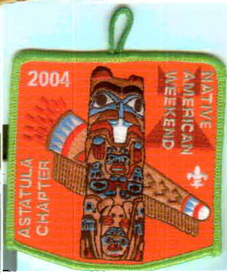
326 Astatula Chapter Native American Weekend; cancelled after the hurricanes of 2004. (left) GRN bdr; 175 made. (right) LIM bdr; 25 made. Both being sold as fundraisers.