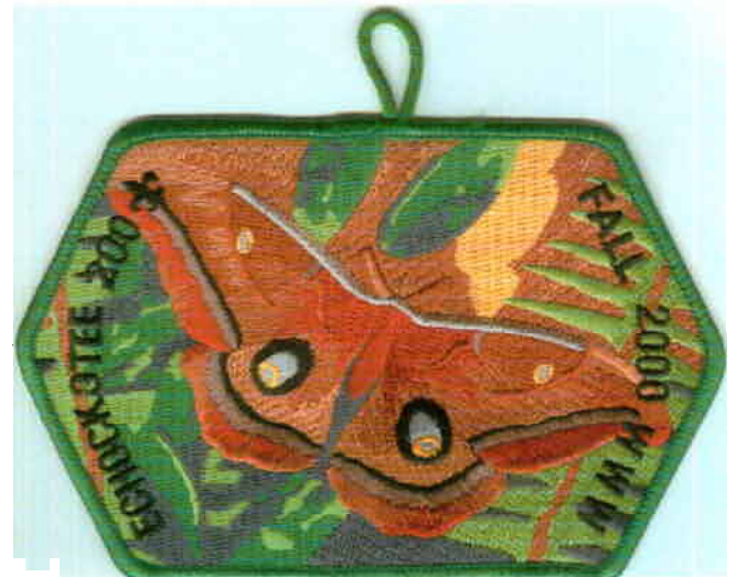
(above) 200 Fall 2002; year of "2000" on patch. Apparently the manufacturer had overruns of this patch, with the wrong year. (left) 326 LLDP and Banquet patch 2004.