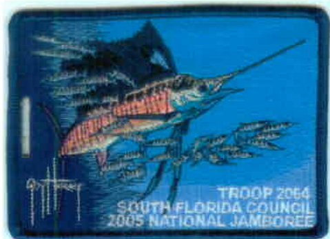
South Florida Council Jamboree 2005; luggage tags (one for each troop)