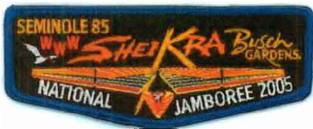
85-S-46 2005 National Jamboree.