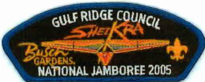
Gulf Ridge Council JSP 2005-D "Sheikra"; theme of "Busch Gardens Rollercoasters".