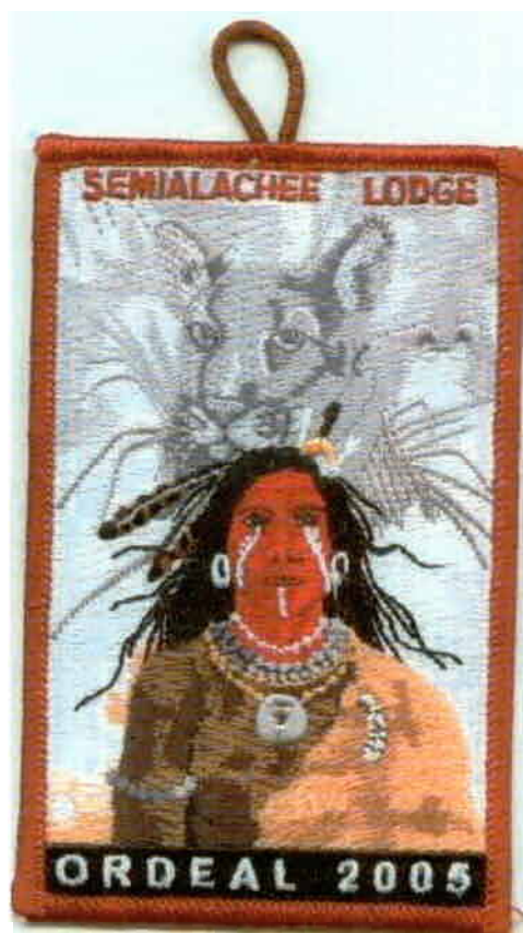
239 Ordeal 2005