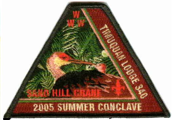
340 Summer Conclave 2005.