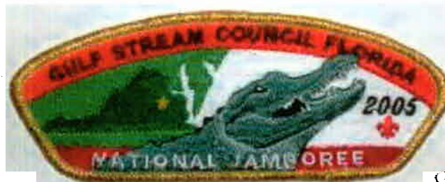
Gulf Stream Council JSP 2005-B alligator; theme depicting Florida wildlife.