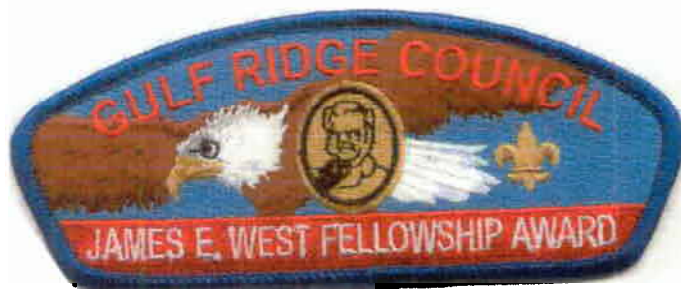
Gulf Ridge Council S-? 2005; James E. West Fellowship (donation CSP)