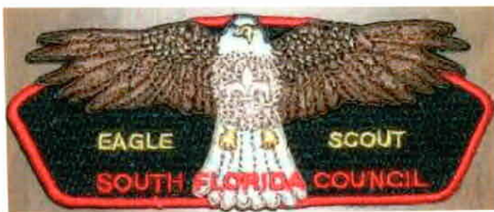
South Florida Council S-? 2005; Eagle Scout CSP