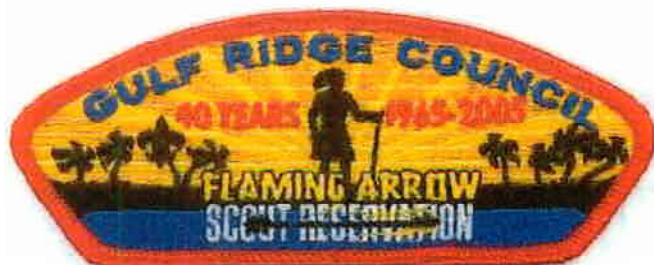
Gulf Ridge Council S-? 2005; Flaming Arrow Scout Reservation 40th Anniversary