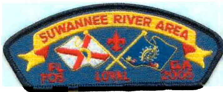
Suwannee River Area 2005 FO$ "Loyal"; 2nd in annual series; $200 donation.