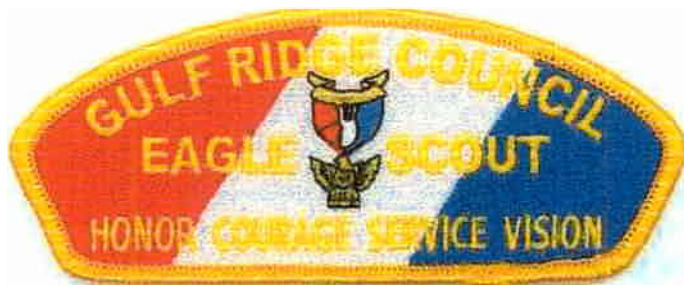
Gulf Ridge Council S-? 2005; Eagle Scout CSP