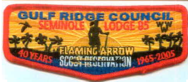
85-S-47 2005; Flaming Arrow Scout Reservation 40th Anniversary; 200 made.