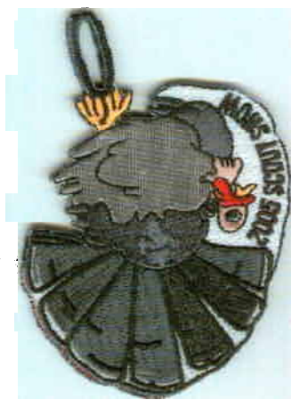
237 Gulf Ridge Council Scout Show Service. (left) service patch; has button sewn onto back of patch; above slit, so that button loop on other patch can be inserted. (center, right) same patch; pig side, and turkey side.