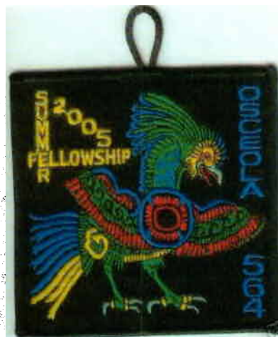
(left) 564 year patch 2005. (above) 564 Summer Fellowship 2005.