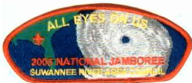
Suwannee River Area Jamboree 2005-A BLU background; "day" JSP