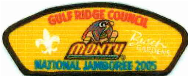
Gulf Ridge Council JSP 2005-C "Montu"; theme of "Busch Gardens Rollercoasters".