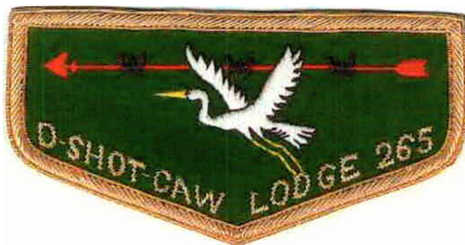
265-B-4 2005; design of F-2. Issued in conjunction with the lodge's 50th anniversary.