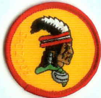
South Florida Council Jamboree 2005; patrol medallions