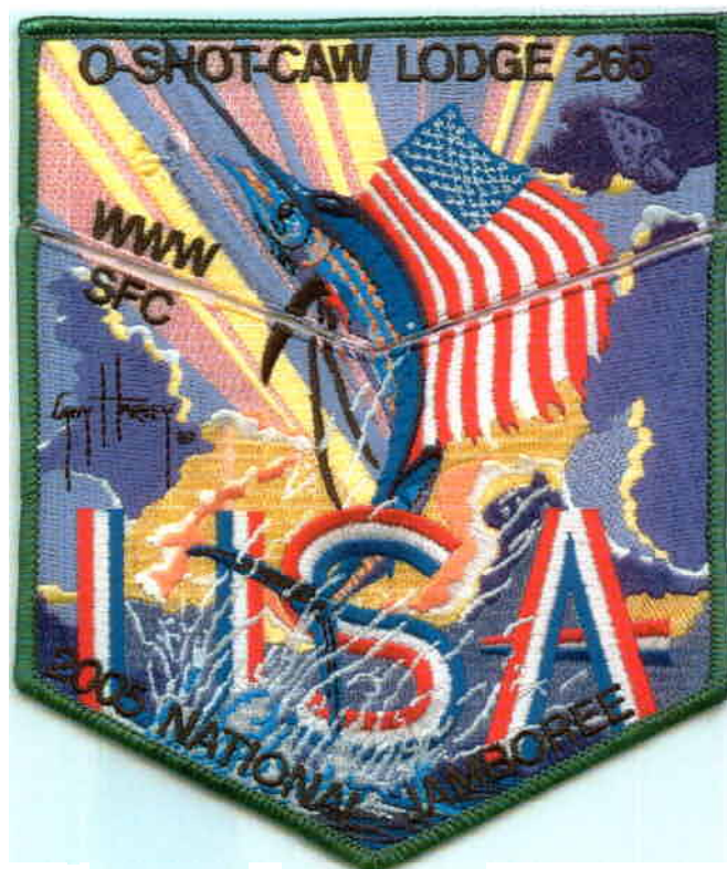
265-S-97 2005 Jamboree; marlin design; GRN bdr; top of 2 piece set.