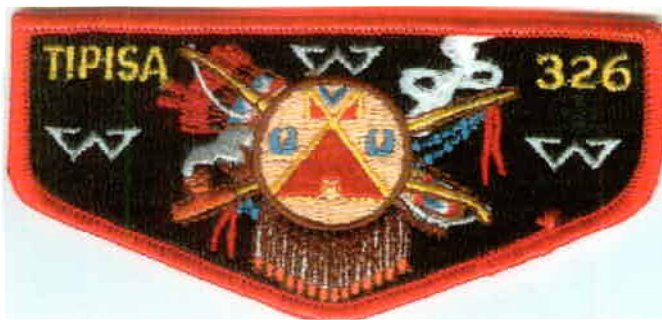
326-S-36 2005; 14 feathers; ROR border; Ordeal.