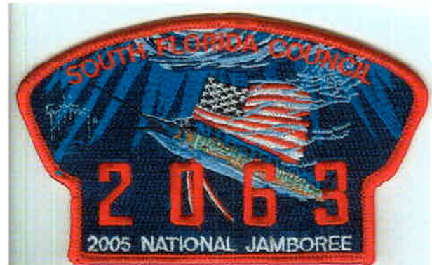
South Florida Council JSP 2005-C Troop 2063; RED border.