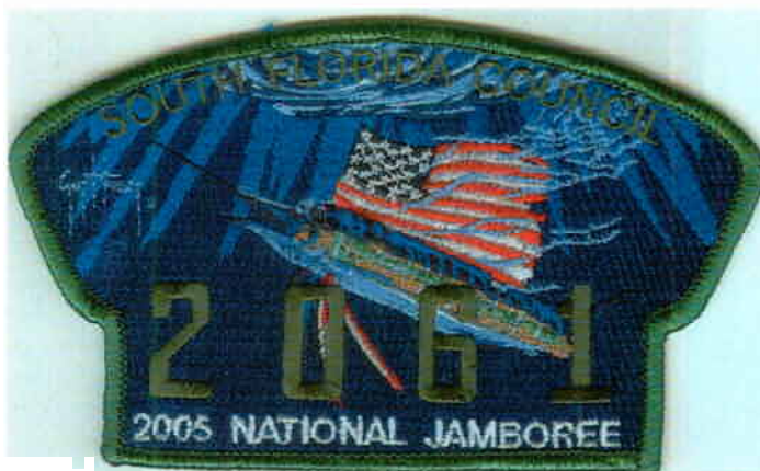
South Florida Council JSP 2005-A Troop 2061; GRN border.