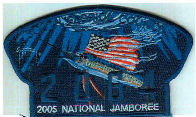
South Florida Council JSP 2005-D Troop 2064; DBL border.