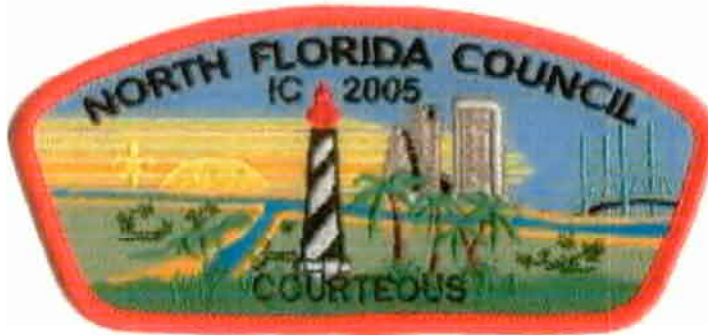
North Florida Council FO$ 2005 $100 donation