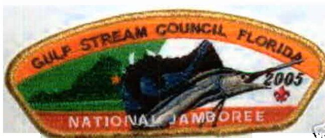
Gulf Stream Council JSP 2005-A Marlin; theme depicting Florida wildlife.