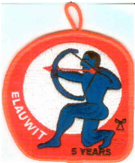
(above) 326 Elauwit Chapter X-5 2005; Fifth anniversary pocket patch. (right) 326 Elauwit Chapter J-1; 100 made.