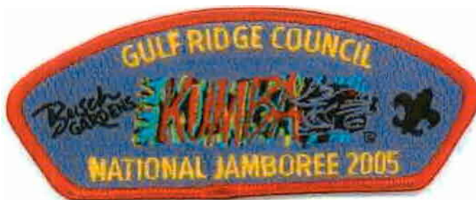
Gulf Ridge Council JSP 2005-B "Kumba"; theme of "Busch Gardens Rollercoasters".