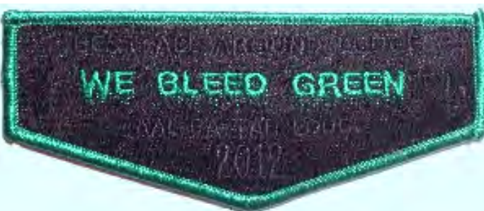
237-S-115 2012; BEST ALL AROUND LODGE