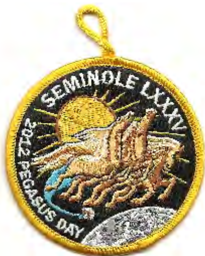
085 2012 PEGASUS DAY service event