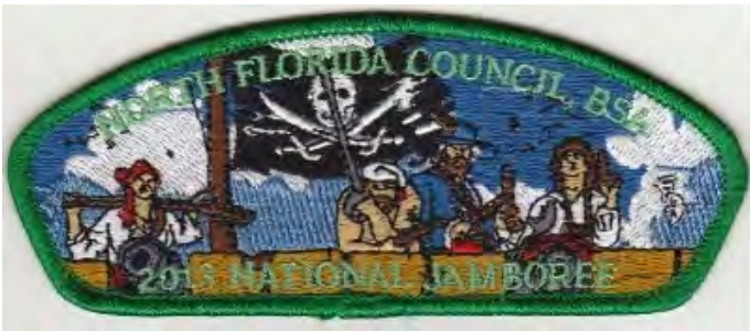
North Florida Council JSP 2013; "Blood and Thunder"