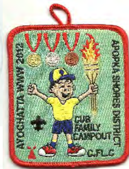
326 Ayochatta Chapter 2012 Cub Family Campout