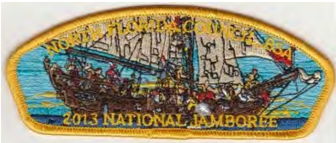
North Florida Council JSP 2013; "Forty Thieves"