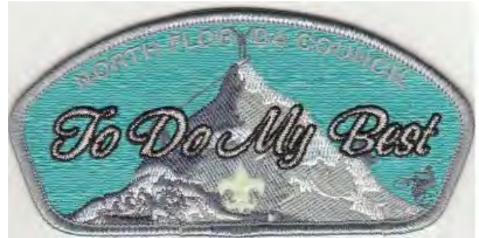
North Florida Council JSP 2013; "To Do My Best"