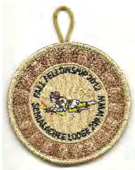
239 2012 Fall Fellowship