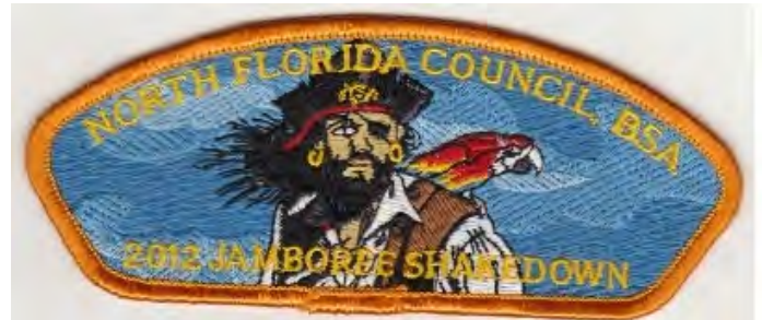
North Florida Council JSP 2013; 2012 Shakedown