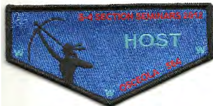
564-S-52 2012; Section S-4 Seminars Host; 300 made