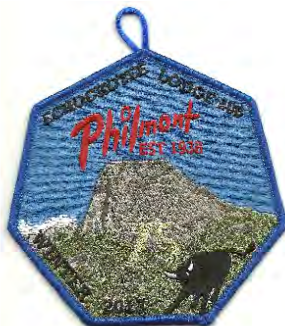
200 2013 Winter Fellowship. Part of 2013 series "High Adventure"; 400 made.