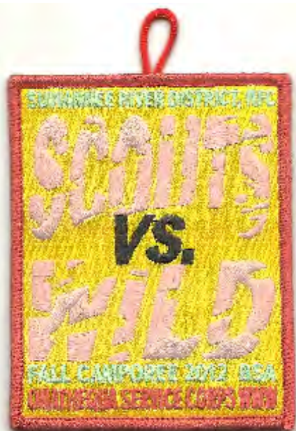
200 Onathequa Chapter 2012 District Camporee Service Corps; 60 made