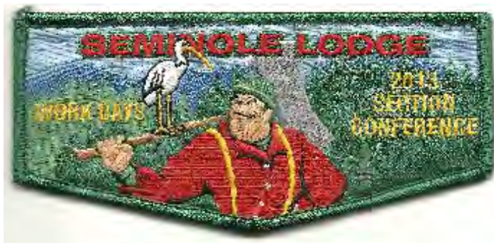
085-S-65 2012; 2013 Section S-4 Conference Work Days