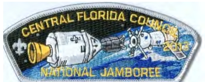
Central Florida Council JSP 2013; Apollo-Soyuz