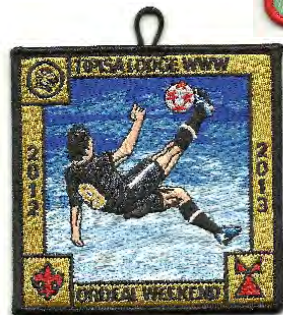
326 2012-2013 Ordeal Weekend. Part of 2012-2013 series "Athletics of an Unnamed University in Orlando"