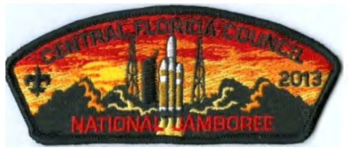
Central Florida Council JSP 2013; rocket launch