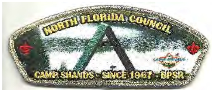
North Florida Council SA-?? 2012; Camp Shands "SINCE 1967"; GMY border