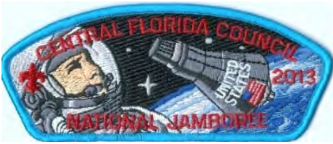
Central Florida Council JSP 2013; Mercury capsule