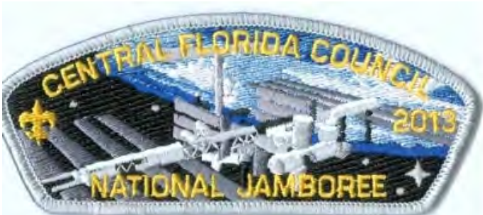
Central Florida Council JSP 2013; space station