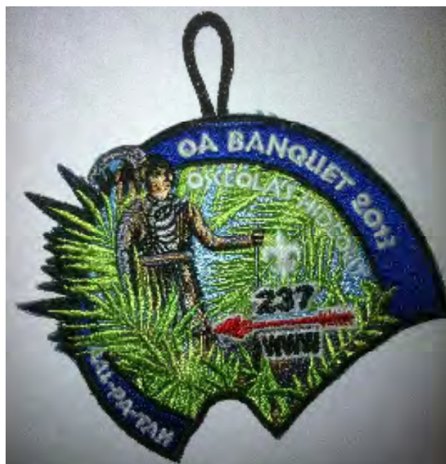
237 2013 Banquet