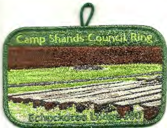
200 2012 Fall Fellowship. Part of 2012 series "Camp Shands Structures"; 500 made.