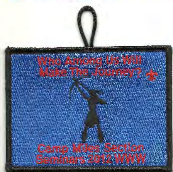
(left) Section S-4 2012 Summer Activity patch (NOAC, OAWV, OATC, OAOA). (above) 2012 Section S-4 Seminars patch.