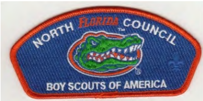
North Florida Council JSP 2013; "University Of Florida Gators"