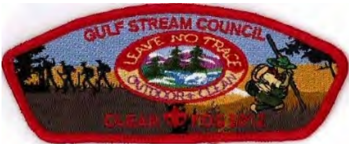
Gulf Stream Council SA-?? 2012;; FO$