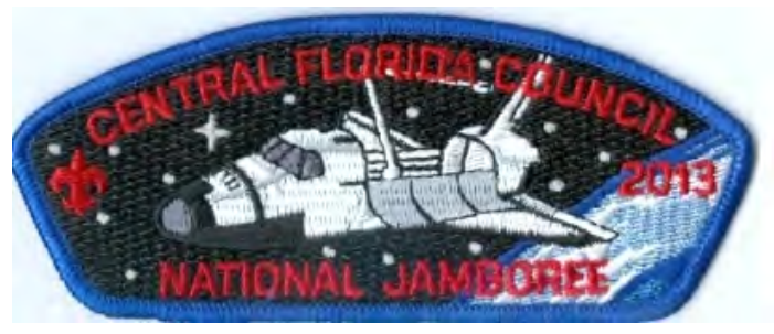
Central Florida Council JSP 2013; space shuttle