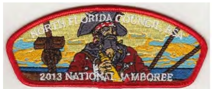
North Florida Council JSP 2013; "No Prey No Pay"