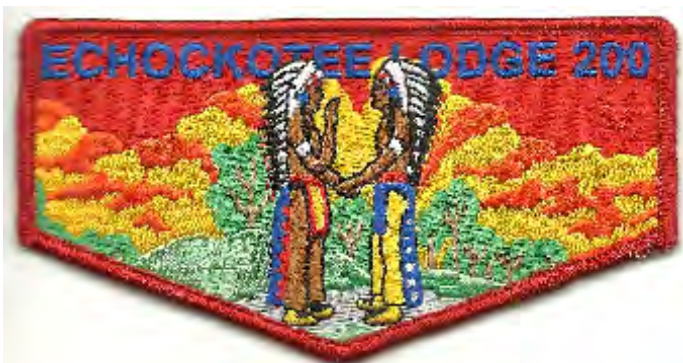
200-S-49 2012; unrestricted; 2000 made