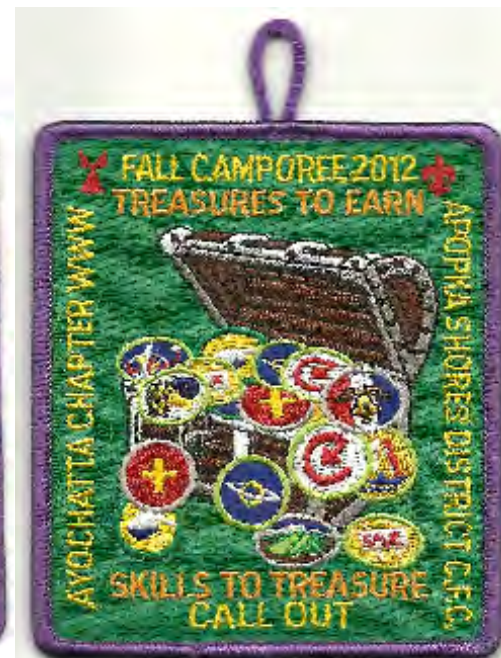
326 Ayochatta Chapter (left) 2012 Fall Camporee; 300 made. (right) 2012 Fall Camporee Call Out; 200 made.