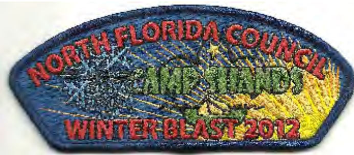
Noprth Florida Council SA-?? 2012 Winter Blast; attendee (snowflake)