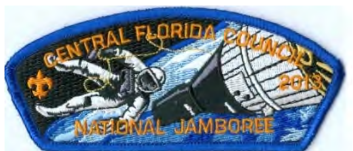
Central Florida Council JSP 2013; space walk