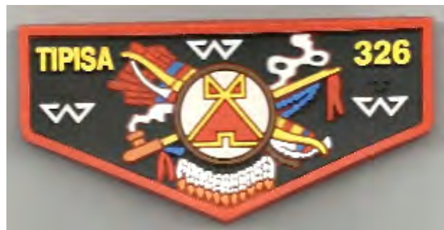
326 Rubber flap. 2012. Pin backs.