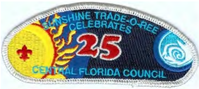
Central Florida Council SA-?? 2012; 25th anniversary Sunshine Trade-O-Ree