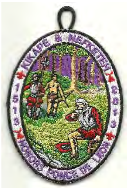
326 Kikape Chapter X-5 (also Nefkete Chapter X-1) 2012; HONORS PONCE DE LEON 1513—2013; 300 made.