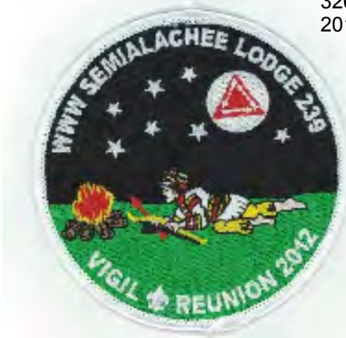
239 2012 Vigil Reunion