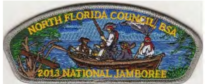
North Florida Council JSP 2013; "Hidden Cove"