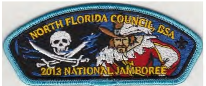
North Florida Council JSP 2013; "Captain Morgan"