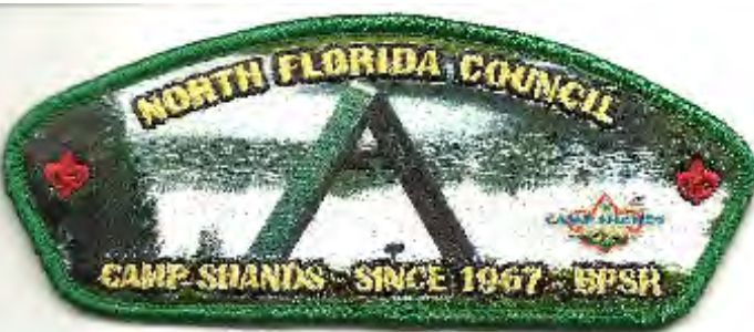
North Florida Council SA-?? 2012; Camp Shands "SINCE 1967"; GRN border