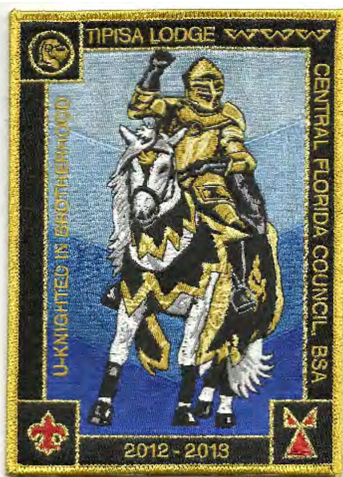
326 2012-2013 Year patch. Part of 2012-2013 series ""Athletics of an Unnamed University in Orlando""