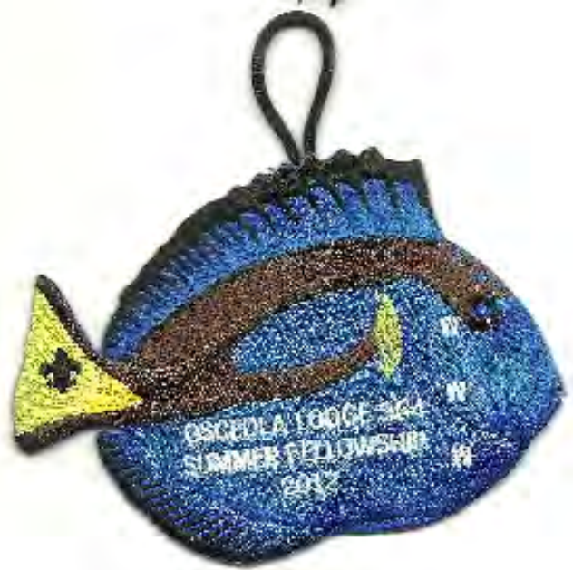
564 activity patches 2012. (above, left) Lodge Workday. (above, right) Summer Fellowship. (below, left) LLDC. (below, right) Fall Fellowship. Parts of 2012 series "Tropical Fish"