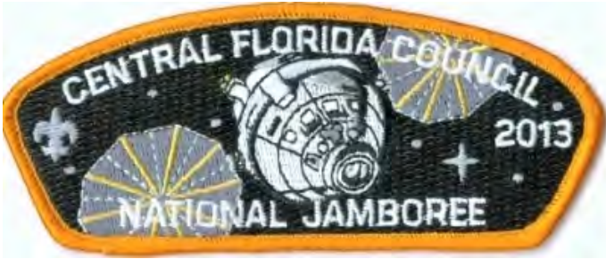
Central Florida Council JSP 2013; re-entry capsule