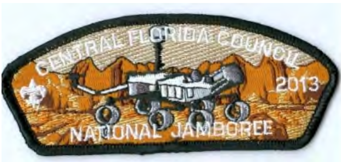
Central Florida Council JSP 2013; Mars rover