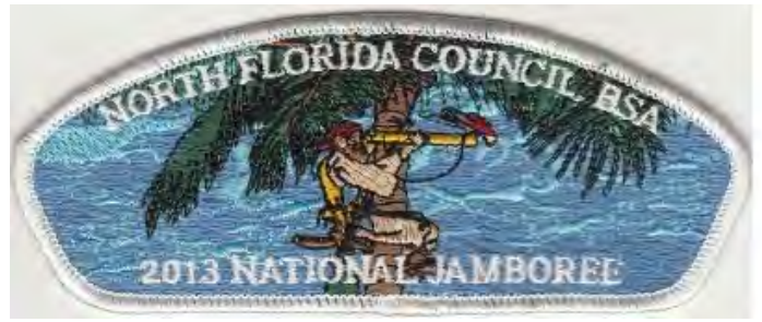
North Florida Council JSP 2013; "Bid's Eye View"