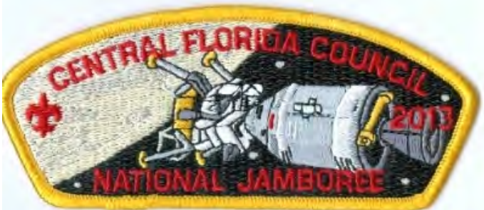
Central Florida Council JSP 2013; lunar and command modules