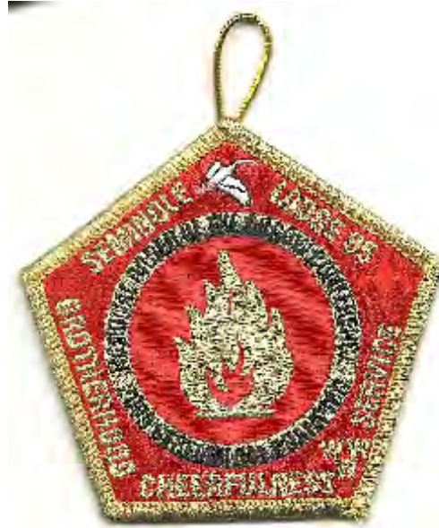
085-X-9.1 2009; NOAC Ceremonial Champion; GMY border