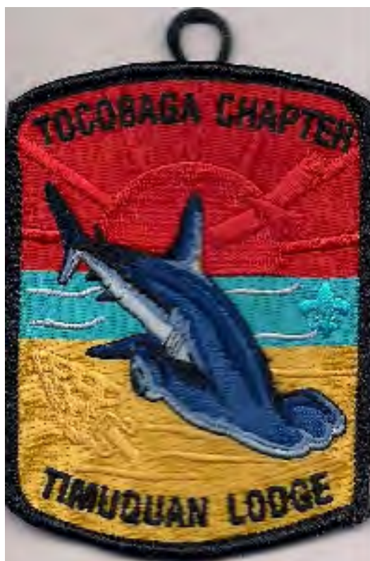
340 Tocobaga Chapter X-2 2013