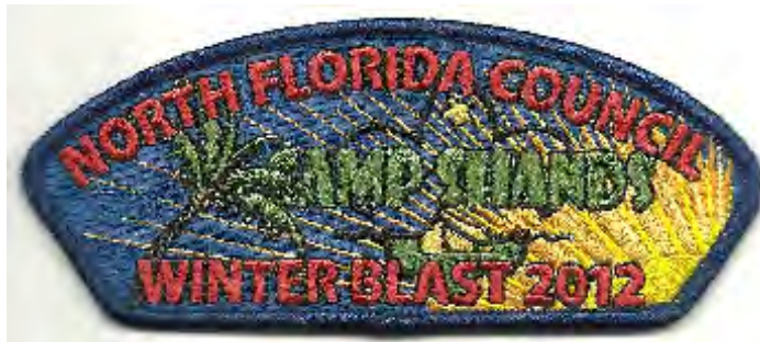
Noprth Florida Council SA-?? 2012 Winter Blast; staff (palm tree)