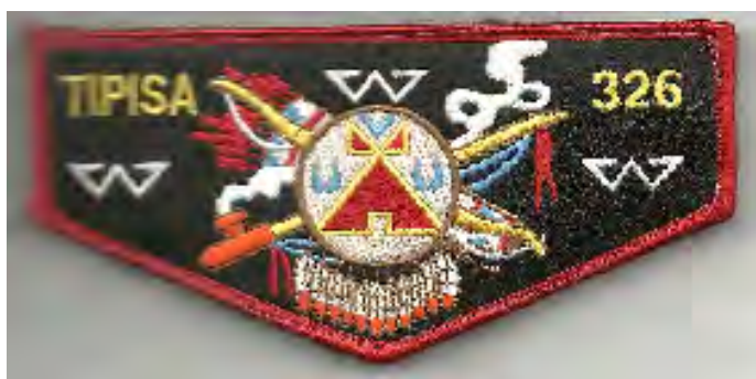
326-S-45b 2012; with sound chip in back