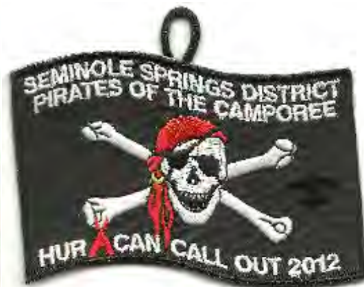
326 Huracan Chapter (above) 2012 Camporee Call Out; 400 made. (right) 2012 hand-painted felt patch; 104 made.