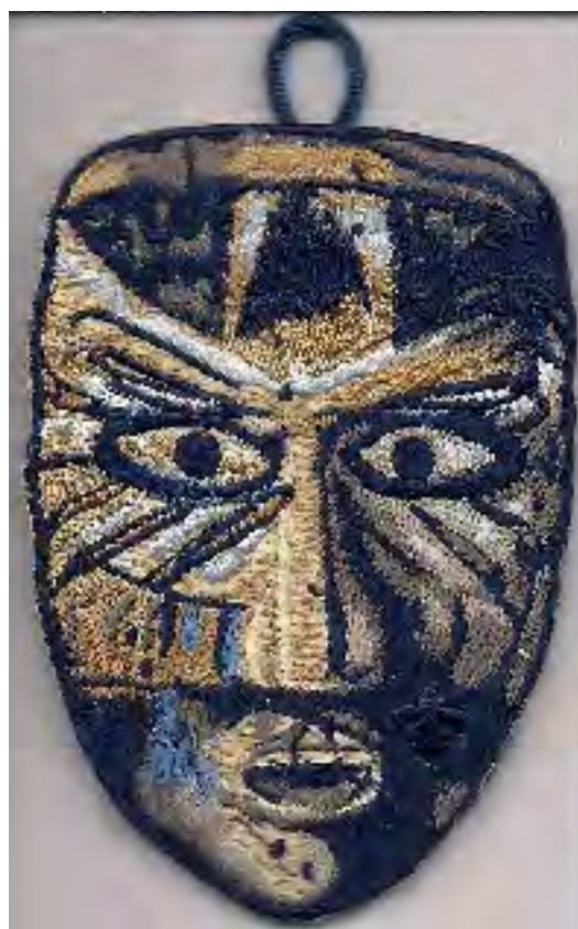
340 Calusa Chapter X-3 2013