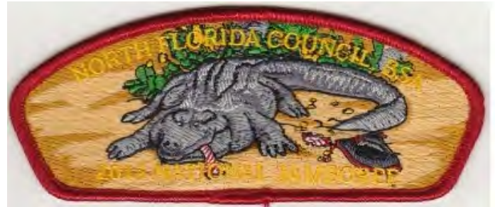
North Florida Council JSP 2013; "Pirate Gormet"