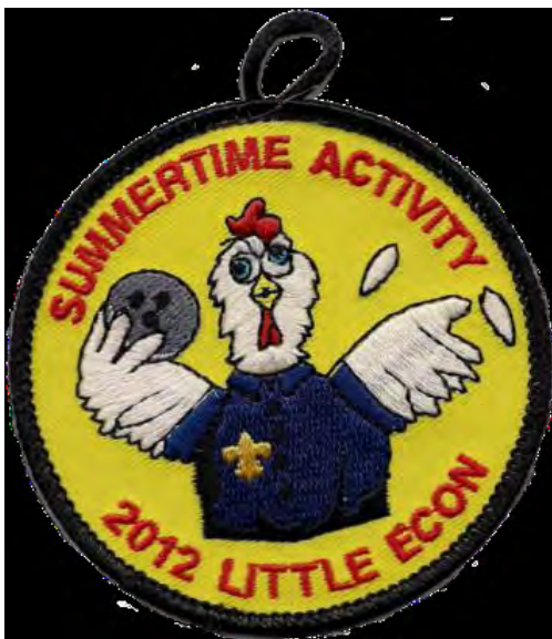
326 Tosohatchee Chapter 2012 (above Summertime activity. (below) Cub Sciout famil campout.