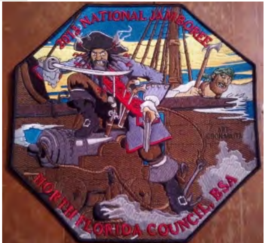
North Florida Council National Jamboree 2013; jacket patch